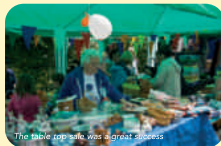
The table top sale was a great success

Many of you have been supporting our appeal, including Pam Ritson and Kay Twigg, who held a table top sale and sold