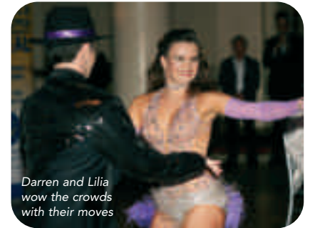
Darren and Lilia wow the crowds with their moves

Guests enjoyed a breathtaking dance display from local celebrities Darren Bennett and Lilia Kopylova from BBC's Strictly Come Dancing, and had the chance to try their luck at Las Vegas style gaming tables. The Lounge Lizards Duo and Tom Hardy Swing