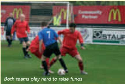
Both teams play hard to raise funds

The day was a great success and all funds were divided equally between the Adult Cystic Fibrosis Unit and Ashgate Hospice in Chesterfield. As well as staging the charity football match, the Royal Mail employees helped raise additional funds by organising a fancy dress basketball match in May and a cake sale and raffle at Easter.