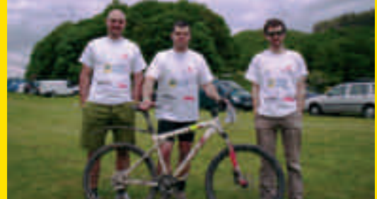
Three members of the team get ready to start their challenge!